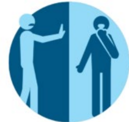
Avoid contact with sick people