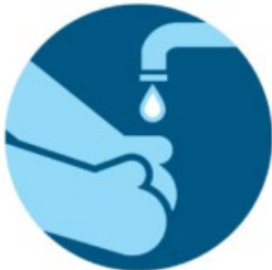
Wash hands often