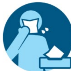
Cover mouth/nose with a tissue or sleeve when coughing or sneezing