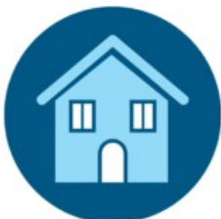
Stay home while you are sick; avoid others