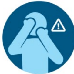
Avoid touching eyes, nose, or mouth with unwashed hands