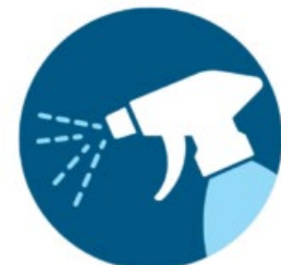
Clean and disinfect frequently touched objects and surfaces